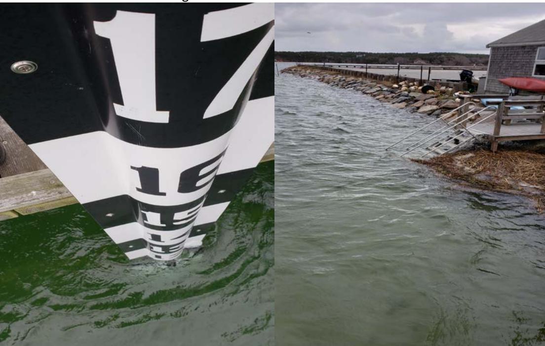
High Tide Photos at Pamet Harbor