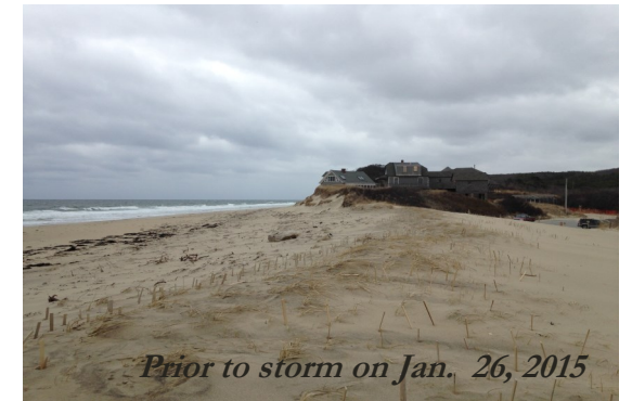
Prior to storm on Jan. 26, 2015