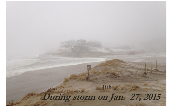
During storm on Jan. 27, 2015