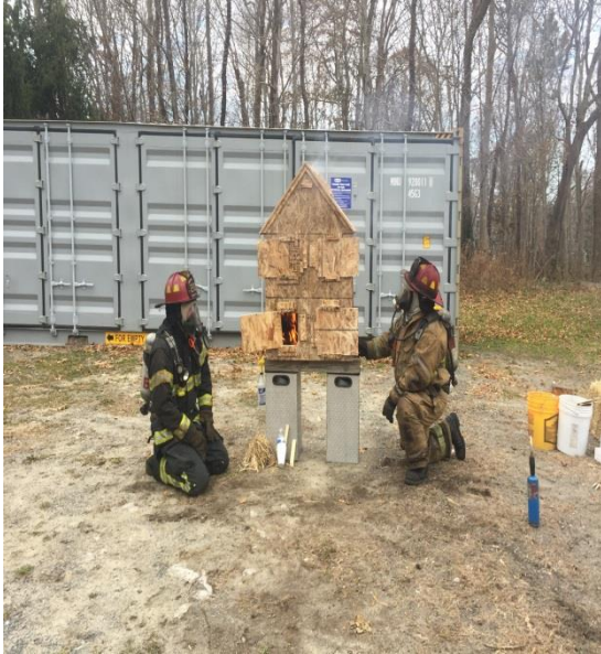
Fire Chief Training