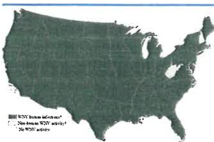
Activity and Surveillance Check where WNV is active...