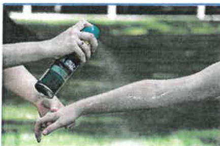
Mosquito Control Everyone can help...