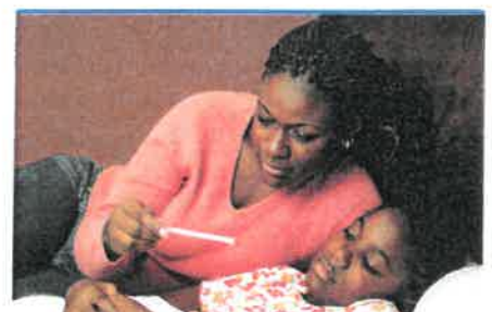
Feeling feverish? Could it be WNV?