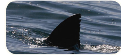
great white dorsal fin