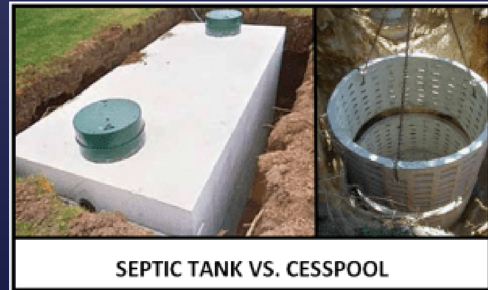
SEPTIC TANK VS. CESSPOOL