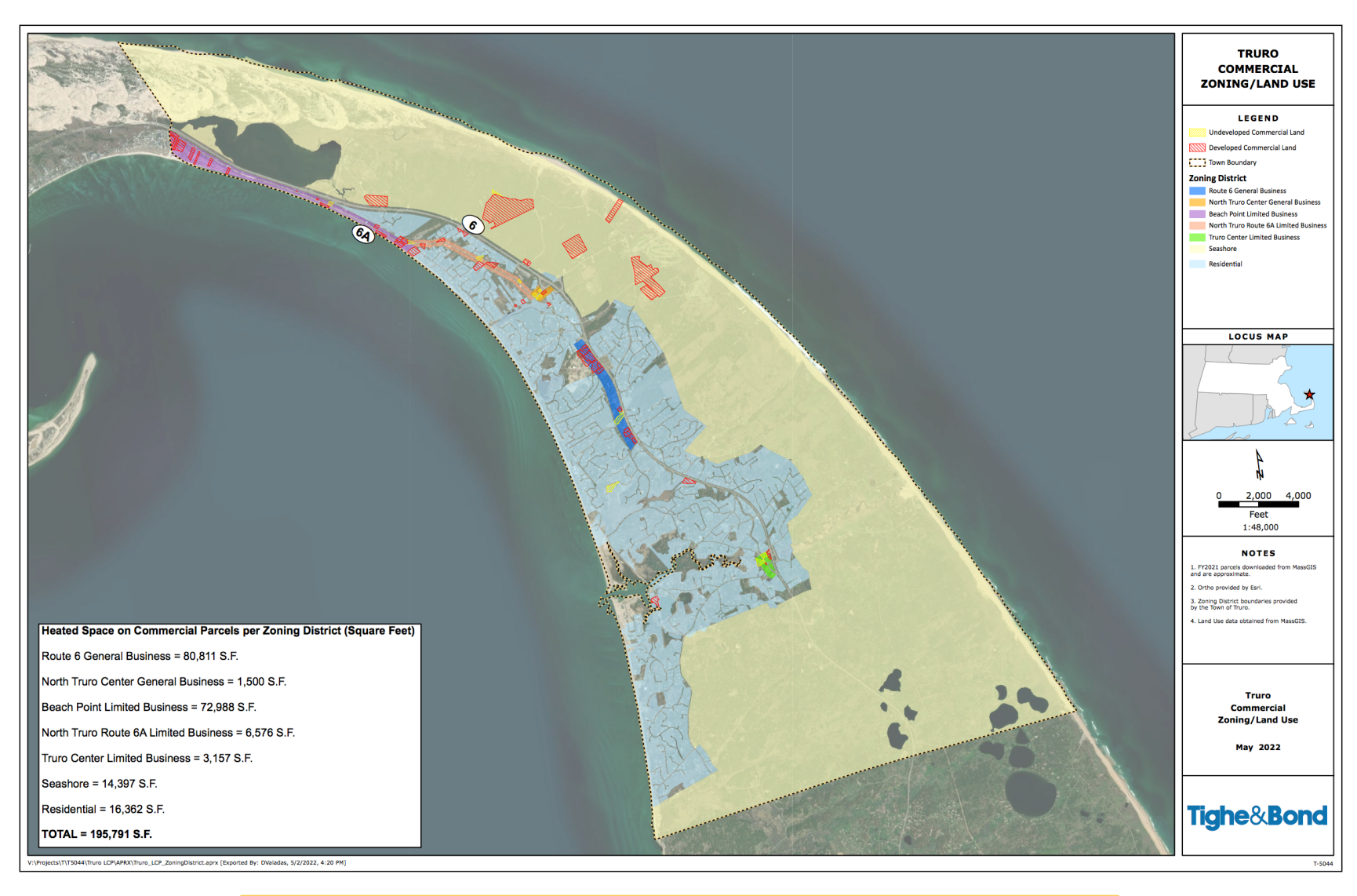
Figure 2. Commercial Districts and Square Footage of Commercial Space in Truro