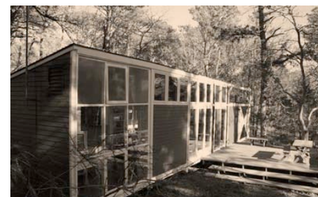
Chermayeff House, 1951, Black Pond Road

and two-story motel blocks were built on Beach Point and North Truro. Truro retained some of its agricultural land, including Hillside Farm (Truro Vineyards) while others were developed such as Highland Dairy which became Horton's Trailer Park. Truro also became the site of a large military radar installation with a small neighborhood built to support it.