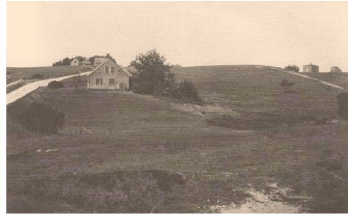
Early settlement along Depot Road, note rare example of Federal five-bay two-story house in upper right

The period from the late-18 th to the mid-19 th century was a time of tremendous growth in Truro, spurred by increases in local and offshore whaling, fishing, and fishing-related industries such as wharves, chandleries, salt works, and shipbuilding. The population rose from 1200 in 1776 to over 2000 by 1830 and Pamet Harbor emerged as Truro's largest port. Many of the extant houses which survive from this period are located along the Pamet River and Harbor, Great Hollow, and Pond Village. These houses are modest 3/4 or full Capes reflecting Federal and then Greek Revival details fashionable at the time. A few larger two-story five-bay Federal houses were also built, as well as three-bay gable-front Greek Revival houses with lateral ells. Important surviving institutional buildings were also constructed during this period, including the Congregational Church (1827) and Union Hall (1848) on Town Hall Hill and Christian Union Church (1840) in Pond Village. Transportation routes, both east-west and north-south were improved throughout Truro and, in 1855, the first bridge between Truro in East Harbor and Provincetown was constructed which greatly improved inter-town transportation.