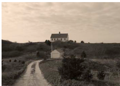
Hopper House

Post-WWI prosperity and the advent of affordable automobiles increased Truro's accessibility as a tourist destination and ushered in the second phase of development from 1920 to WWII. Despite a slow-down during the Depression, more individually-owned cottages were constructed, and a new form of resort architecture emerged – the roadside cottage colony. These clusters of small cottages were most commonly built along Beach Point, but can also be found further south on Shore Road, Route 6 and Coast Guard Road.