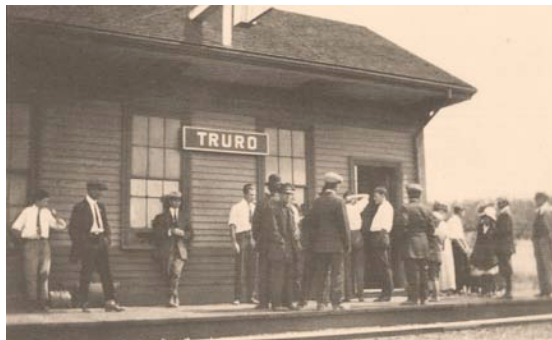
Pamet Harbor train station at end of Depot Road

By 1860, whaling and fishing industries in Truro suffered from a depletion of local whale stock and reduction in harbor capabilities due to the silting of Pamet Harbor and drifting dunes in East Harbor. Many maritime industries declined or moved elsewhere, including Provincetown. By the late-19th century, trap fishing, fish processing and local agriculture remained as the primary sources of economic activity, and the population declined by over half. As a result, there was ample housing stock and little residential development occurred during this period, which accounts for the low number of buildings reflecting Victorian-era styles. Portuguese immigrants who had emigrated to work in the fishing industry now constituted 50% of Truro's dwindling population.