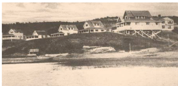
Sladeville, c. 1890

Truro's development into a resort town can be divided into three phases. The first phase, roughly the years 1890-1920, was characterized by the development of resort destinations, located in the Highlands, Ballston Beach, Sladeville, Corn Hill and Whitmanville. Individuals also began to build cottages in these areas as well as Beach Point. These cottages were mostly modest in scale and reflected influences of Eastlake, Queen Anne, Shingle and Colonial Revival styles.