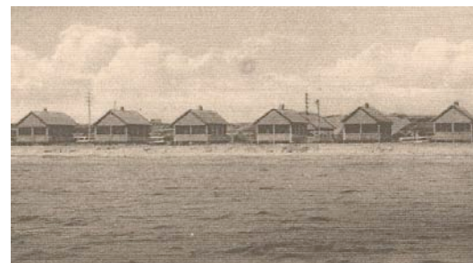
Days Cottages, c. 1935

Truro's development into a resort town can be divided into three phases. The first phase, roughly the years 1890-1920, was characterized by the development of resort destinations, located in the Highlands, Ballston Beach, Sladeville, Corn Hill and Whitmanville. Individuals also began to build cottages in these areas as well as Beach Point. These cottages were mostly modest in scale and reflected influences of Eastlake, Queen Anne, Shingle and Colonial Revival styles.