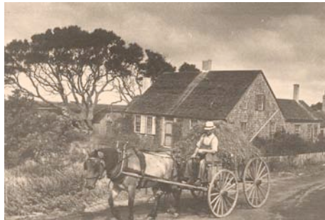
Isaac Small House, c. 1780, Highland Road

In the mid-17 th century, a group of men formed a land development company called the Pamet Proprietors and purchased a large tract of land in what is now Truro from the Pamet Indians. Parcels were sold and permanent settlement began in the late-17 th century, which included the construction of the first meetinghouse in 1704 (on the site of the Old North Cemetery across from the Police Station on Rte. 6). Dispersed settlement continued through the 18 th century, clustered near the bay shore in South Truro, Pond Village, East Harbor, as well as along the Pamet River and the Highlands (where agriculture was the primary activity). These early settlements were supported by the emerging local whaling and fishing (cod and mackerel) industries, together with subsistence farming. The population rose quickly, and by 1765, numbered over 900. Surviving resources from this period consist primarily of modest houses which were originally sited on large tracts of farmed land.