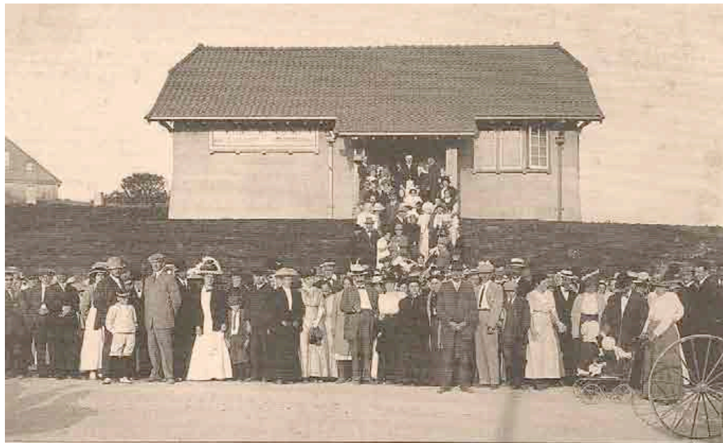
Dedication of Cobb Memorial Library, 1912

The Truro Historical Commission would also like to acknowledge and thank the Town of Truro Community Preservation Act Program for the critical role it played in providing funding for this Survey Plan.