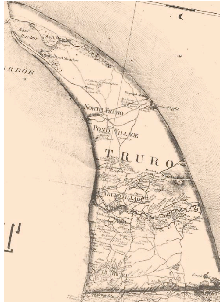
Truro Map, 1858