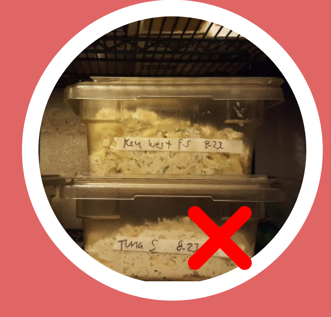
DON'T cover / stack NO deep containers