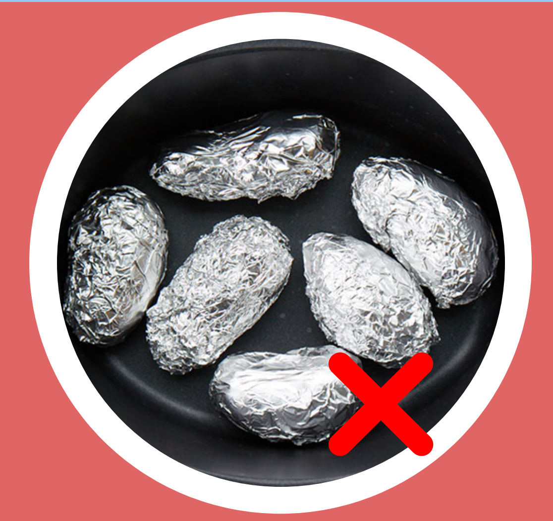
DON'T tightly wrap in plastic or foil