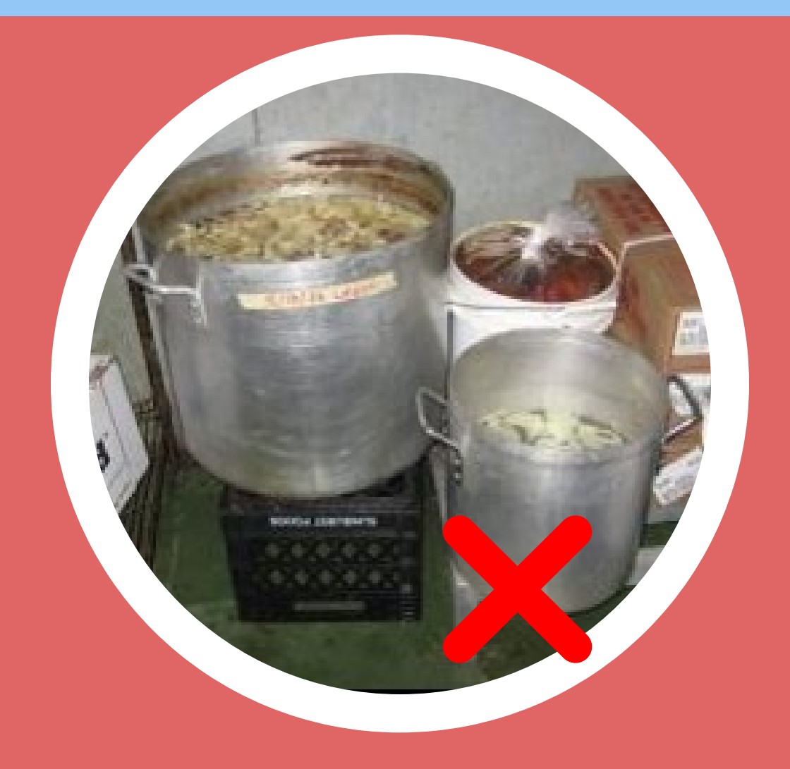
DON'T cool in deep pots in refrigerator