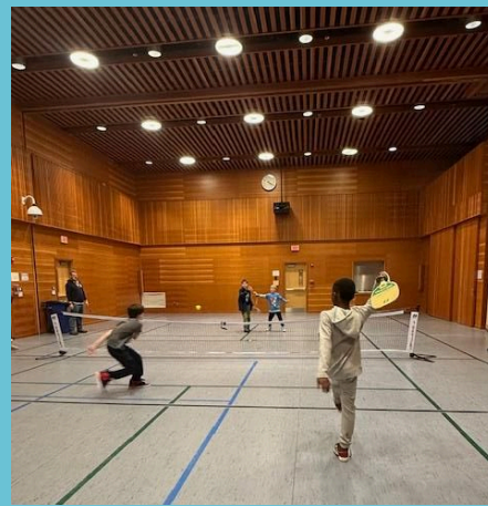
Students learned how to play pickleball and had a BLAST!