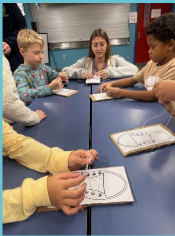
Learning how to Tie shoes